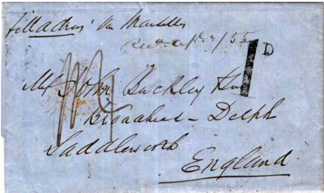
Fig 1. Sydney 27 Jan 1855 per Madras via Marseilles . The P&O ss Madras left Sydney on 27 Jan 1857, the only P&O voyage during the accountancy period. Letter sent unpaid, 1/4d collect, being 6d packet plus 10d due to France for a letter between ¼ and ½ oz. NSW claimed 1d for inland NSW postage. Back stamped at Manchester 1 Apr.