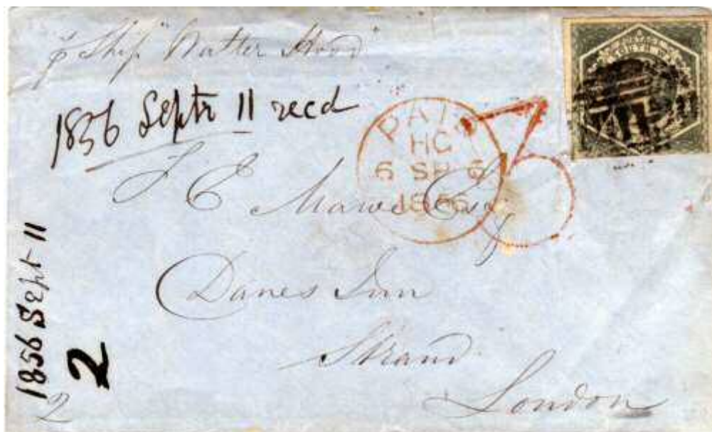
Fig 3. (below). 1856. Sydney to London per ship Walter Hood . She belonged to the Aberdeen White Star Line and was not a contract packet. Fully prepaid 6d, Sydney accounted 3d to the UK by the red hand stamp, and London marked the letter as PAID on arrival. Back stamped Sydney 1 Jun.