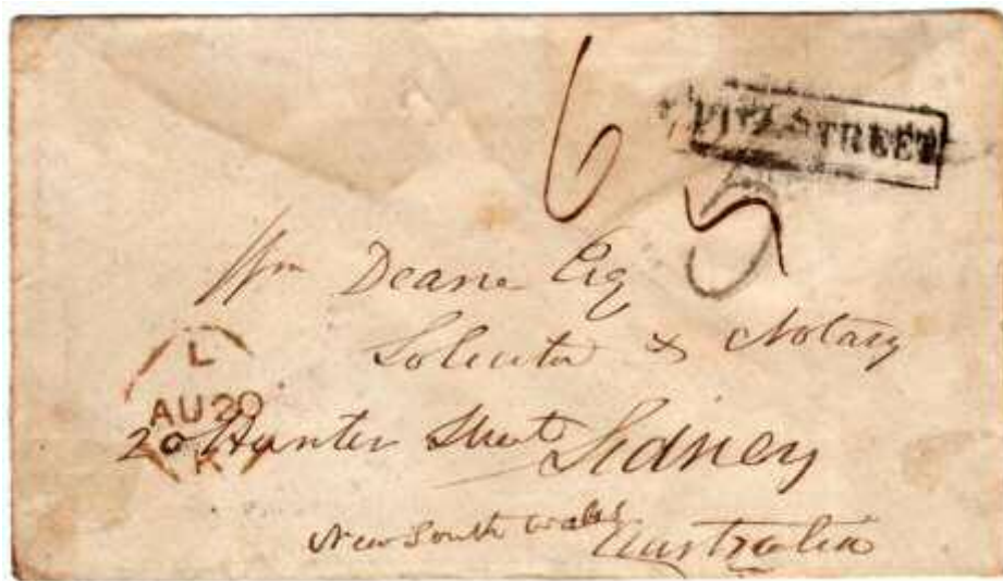
Fig 2. 1856. London to Sydney unpaid. By the White Star clipper White Star , 77 days to Melbourne, the third fastest outbound voyage in 1856, and on to Sydney by the coastal steamer Yarra Yarra . UK stated its claim to 5d with the hand stamp partly obscured under the London street marking, deleted at Sydney where “6” in manuscript added for amount due from addressee. Back stamped Sydney 10 Nov.