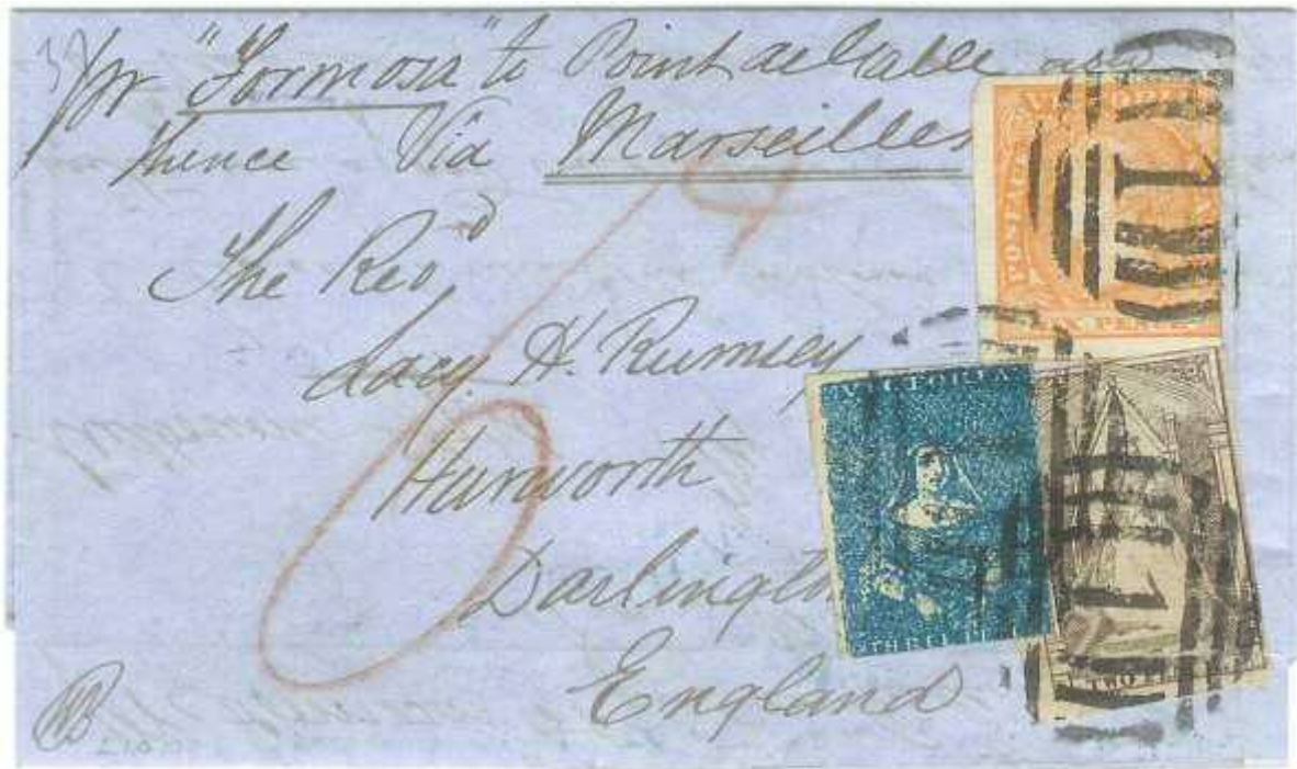
Fig 8. This is the only recorded Half-Length cover sent at the 11d rate via Marseilles (under ¼ oz). Formosa was contracted by Victoria to carry a mail to Galle, thence to UK per P&O, arriving Southampton 17 Oct and London via Marseilles on 13 Oct. The “6” in manuscript is 6d due to the UK, being 1d UK inland on a colonial packet, and 5d due to France for transit fees – the 5d was paid by the UK under the Anglo-French postal treaty. Melbourne backstamp 28 July 56, Darlington 14 October 56. No other markings are present other than the manuscript 6d on the front.