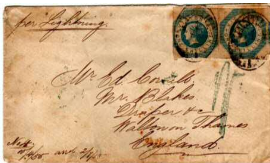
Fig 4. Apr 1855. Melbourne to UK by the world-famous clipper Lightning ; she still holds the record for a big sailing ship from Melbourne to Liverpool – 64 days – but not this voyage – still a respectable 79 days. A double rate letter sent during the “retaliatory” period, prepaid 2 shillings at Melbourne and charged 2 x 6d packet rate on arrival Liverpool with the stylised “1/-“ marking in green ink. Back stamped with the UNPAID version of the Liverpool Australian Packet marking type P28. 7