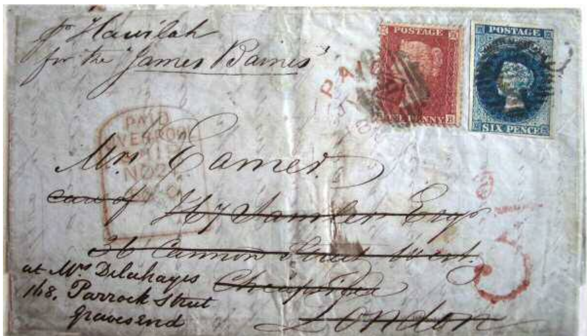
Fig 9. This cover demonstrates in spectacular style that every voyage during the accountancy period has to be very carefully analysed. The small coastal steamer Hawilah took the mail to Melbourne, whence the Black Ball Line’s James Baines left on 8 Aug 1856 under contract as a packet to the Post Office of Victoria, arriving at Liverpool on 21 Nov. Letters from Victoria were treated as packet letters, and accounted for as such, but this