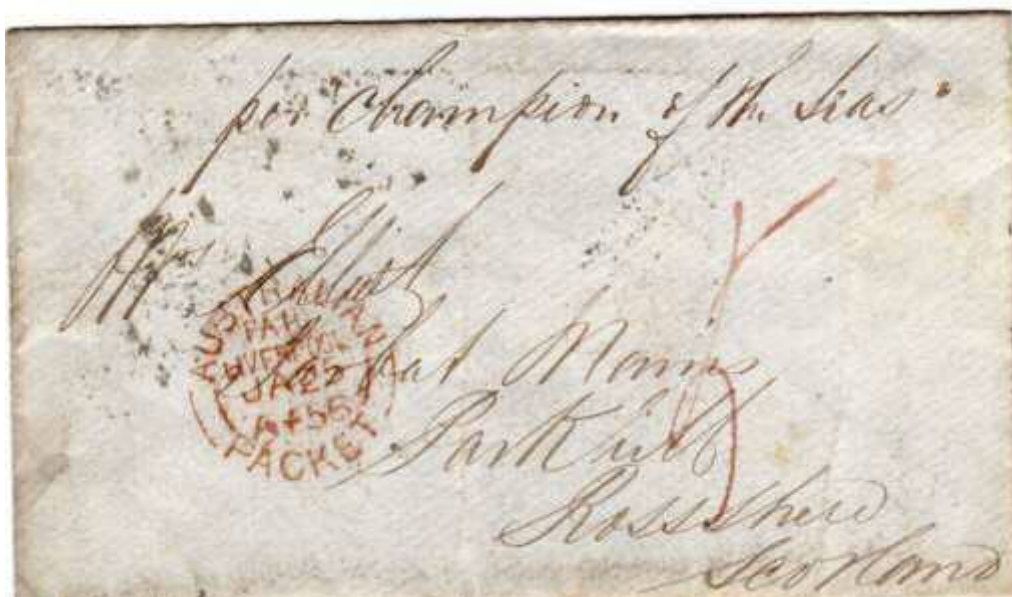
Fig 6. Oct 1855. Victoria to Scotland per Champion of the Seas . Prepaid 6d in cash, of which 5d to UK in red manuscript, as she was a British packet. The first Black Ball contract, of which this is an example, specified a return voyage as a packet; for the second contract the owner, James