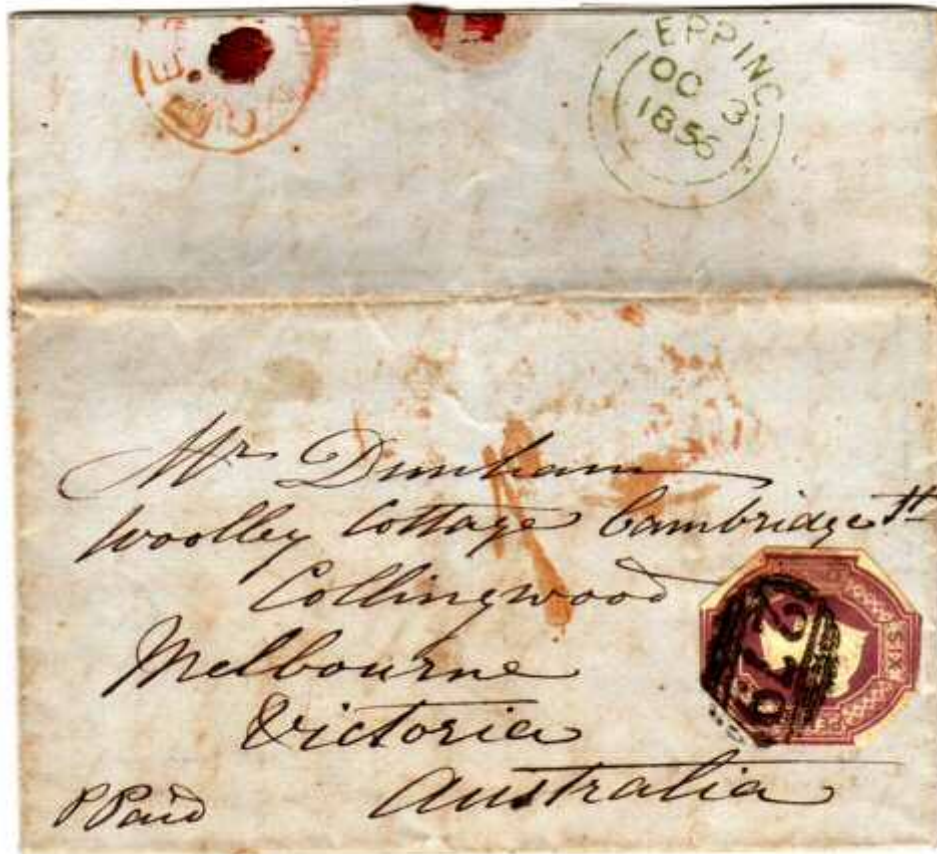
Fig 5. (below). Oct 1856. UK to Melbourne on the last outbound clipper packet mail. Carried by the Black Ball Line's Donald McKay from Liverpool 5 Oct, arrived Melbourne 28 Dec on a slowish passage of 84 days, slightly delayed by having to put into Cork owing to the death of her surgeon. These ships carried hundreds of emigrants and a surgeon was required by the Board of Trade. Prepaid 6d, 1d red accountancy mark for the sum due to Victoria, the retaliatory rate period now being over.