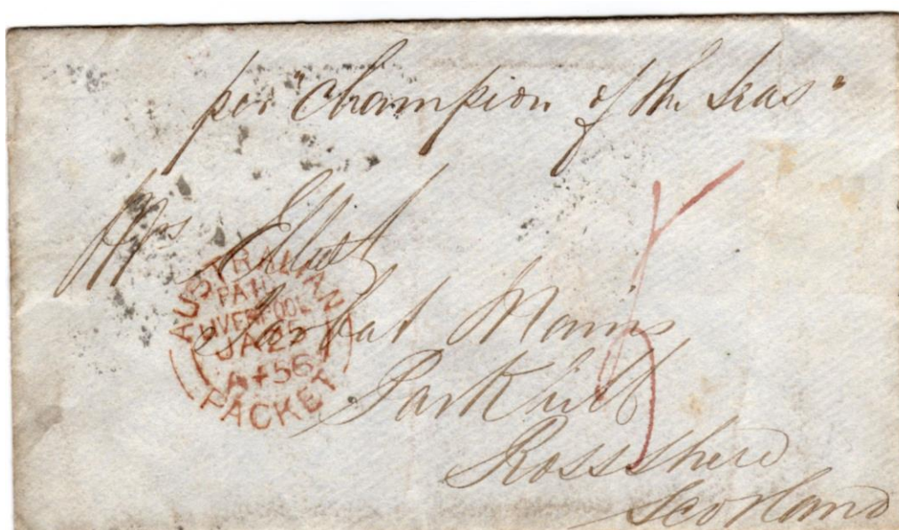
Fig 6. Oct 1855. Victoria to Scotland per Champion of the Seas . Prepaid 6d in cash, of which 5d to UK in red manuscript, as she was a British packet. The first Black Ball contract, of which this is an example, specified a return voyage as a packet; for the second contract the owner, James Baines, refused to undertake a return mail contract to fixed dates 8 so Victoria chartered ships on a single voyage basis as opportunity offered. See Fig 7.