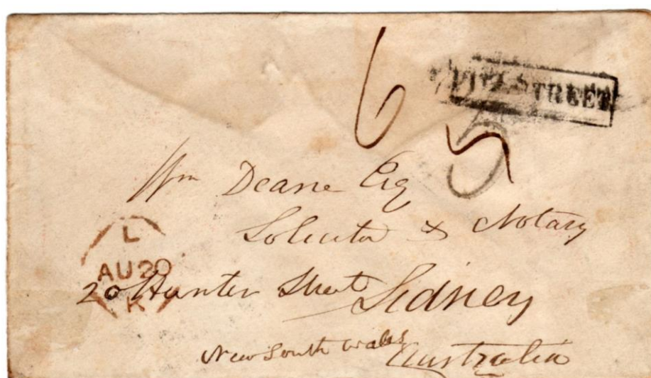
Fig 2. 1856. London to Sydney unpaid. By the White Star clipper White Star , 77 days to Melbourne, the third fastest outbound voyage in 1856, and on to Sydney by the coastal steamer Yarra Yarra . UK stated its claim to 5d with the hand stamp partly obscured under the London street marking, deleted at Sydney where "6" in manuscript added for amount due from addressee. Back stamped Sydney 10 Nov.