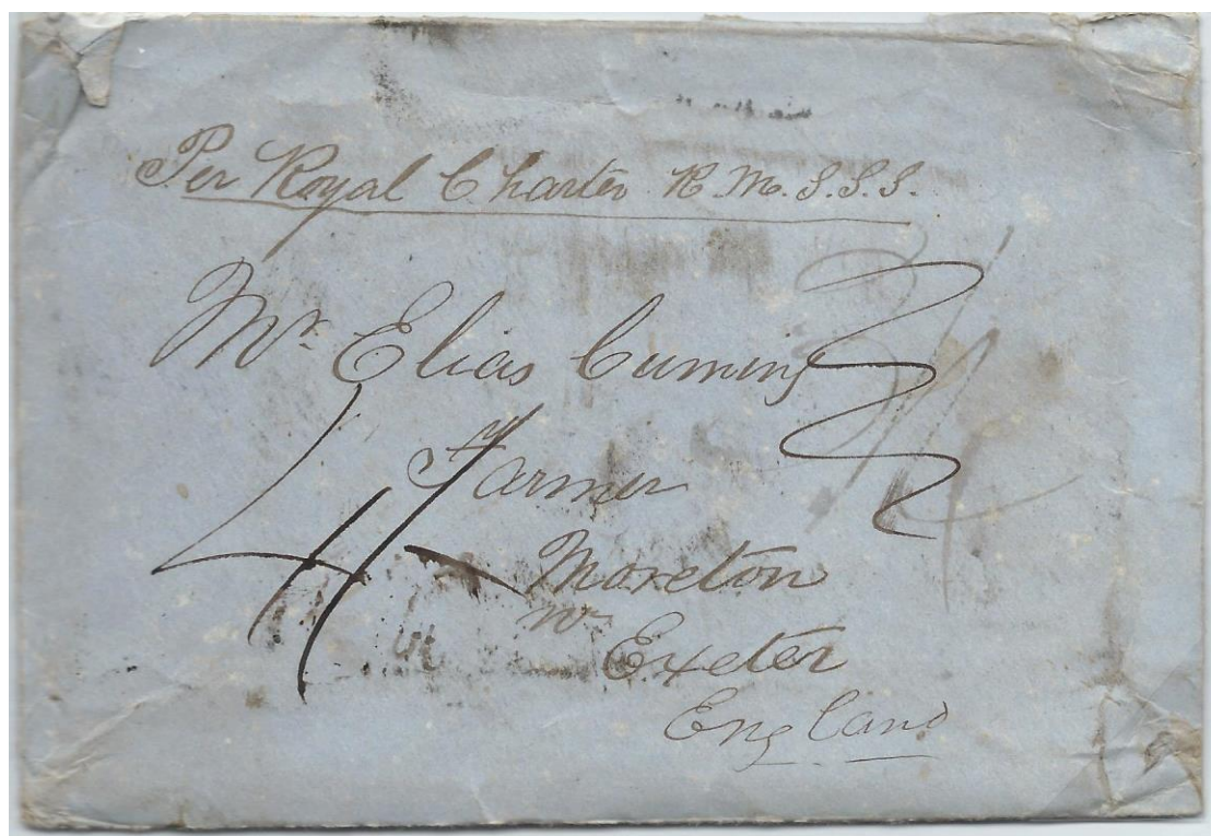
Fig 11. Melbourne 24 May 1856 by colonial packet Royal Charter . Octuple rate for a 3 to 4 ounce letter. Victoria claimed 8 \times 5d = 3/4d at right, crossed through in Liverpool, where the 4/- due from the recipient was added. Unpaid AUSTRALIAN PACKET LIVERPOOL dated 12 Aug, the day she arrived.

Reference: Tabart, Colin: Australia New Zealand UK mails to 1880; Rates Routes and Ships Out and Home Vol 1. The Author, Fareham, 2011.