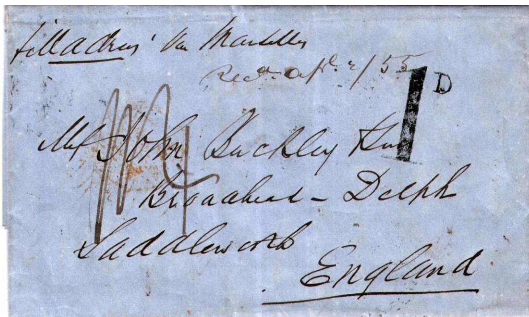
Fig 1. Sydney 27 Jan 1855 per Madras via Marseilles . The P&O ss Madras left Sydney on 27 Jan 1857, the only P&O voyage during the accountancy period. Letter sent unpaid, 1/4d collect, being 6d packet plus 10d due to France for a letter between \frac{1}{4} and \frac{1}{2} oz. NSW claimed 1d for inland NSW postage. Back stamped at Manchester 1 Apr.