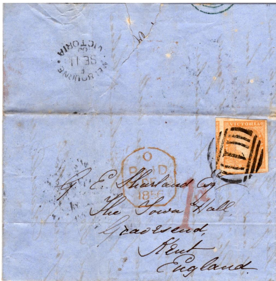
Fig 7. Sep 1856. Melbourne to UK. Carried by the sailing ship True Briton on a single-voyage contract with the Victoria Post Office. 6d prepaid, 1d due to the UK in red for inland postage. 87 day passage arriving Gravesend on 8 Dec.