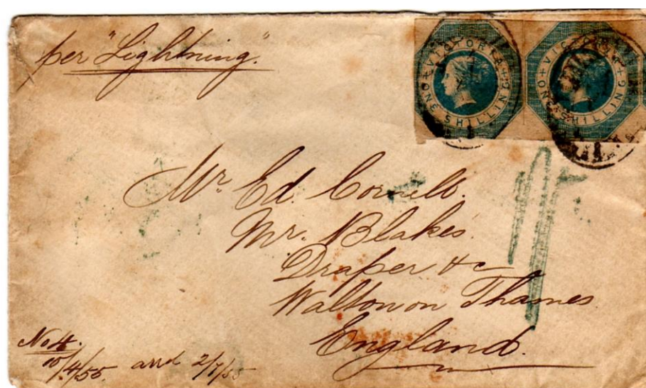
Fig 4. Apr 1855. Melbourne to UK by the world-famous clipper Lightning ; she still holds the record for a big sailing ship from Melbourne to Liverpool – 64 days – but not this voyage – still a respectable 79 days. A double rate letter sent during the “retaliatory” period, prepaid 2 shillings at Melbourne and charged 2 x 6d packet rate on arrival Liverpool with the stylised “1/-” marking in green ink. Back stamped with the UNPAID version of the Liverpool Australian Packet marking type P28. 7